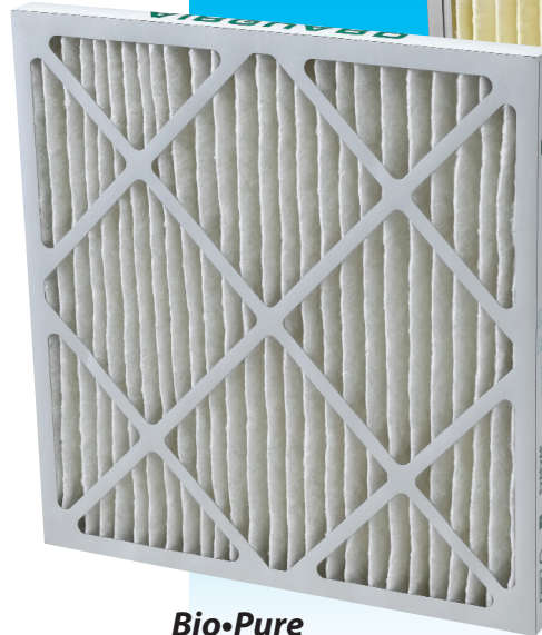
Bio•Pure Antimicrobial Treated Filters