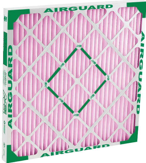
Type DP-High Efficiency